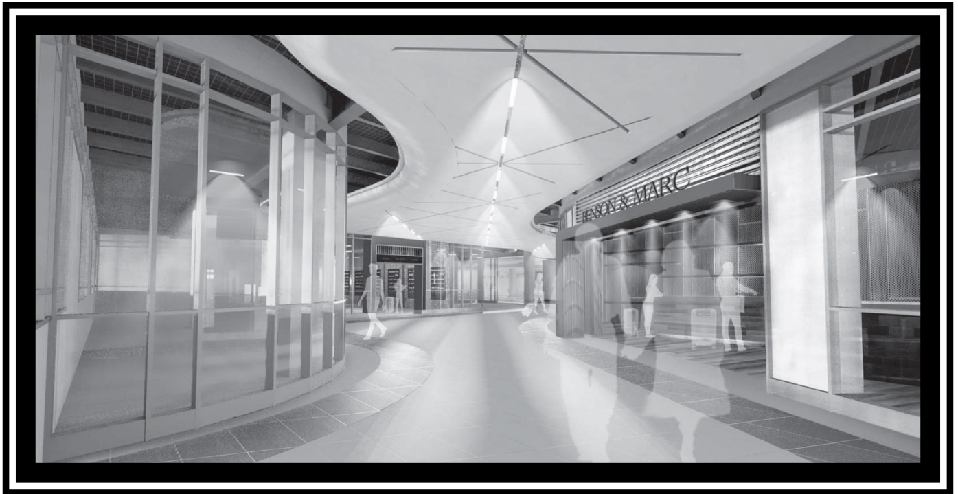
An Artist view of the Duty Free

The CIAA has very recently invited the submission of proposals to Develop and Operate Concessions within the new terminal. The concession spaces will be a mix of Retail, Duty Free/Duty Paid and Food and Beverage. There are 18 spaces available and interested retailers can bid on as many spaces as they like, not as a package but as separate bids for each space. Interested retailers can log onto the Cayman Islands Government E-Bidding Portal at https://cayman.bonfirehub.com/opportunities/3166 to receive proposal documents. Deadline for submission of bids is 4pm on Friday, 30 June 2017.